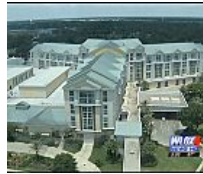
Coast casino scene getting an upgrade