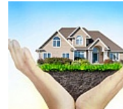
Shocking Tip Saves Mort Payers $4.9K per year