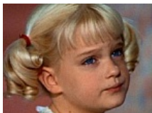
10 TV Little Sisters Who Disappeared From the...