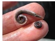
Side Effects: Weight Gain, Rashes, Diarrhea &...