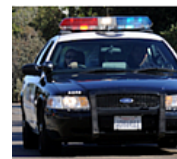
New Rule in Pennsylvania Not Pay Your Next...