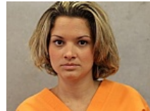
Allentown arrest records. Who do you know?