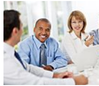
Minority Business Owners' Management Advice Staples