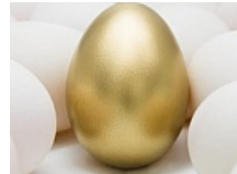
Pennsylvania: Here's a little known way to pay...