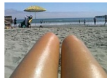
Women have been urged to cease posting these...