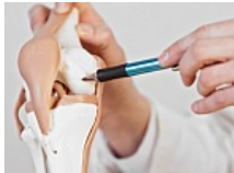
Shocking 10 second joint relief trick that's...